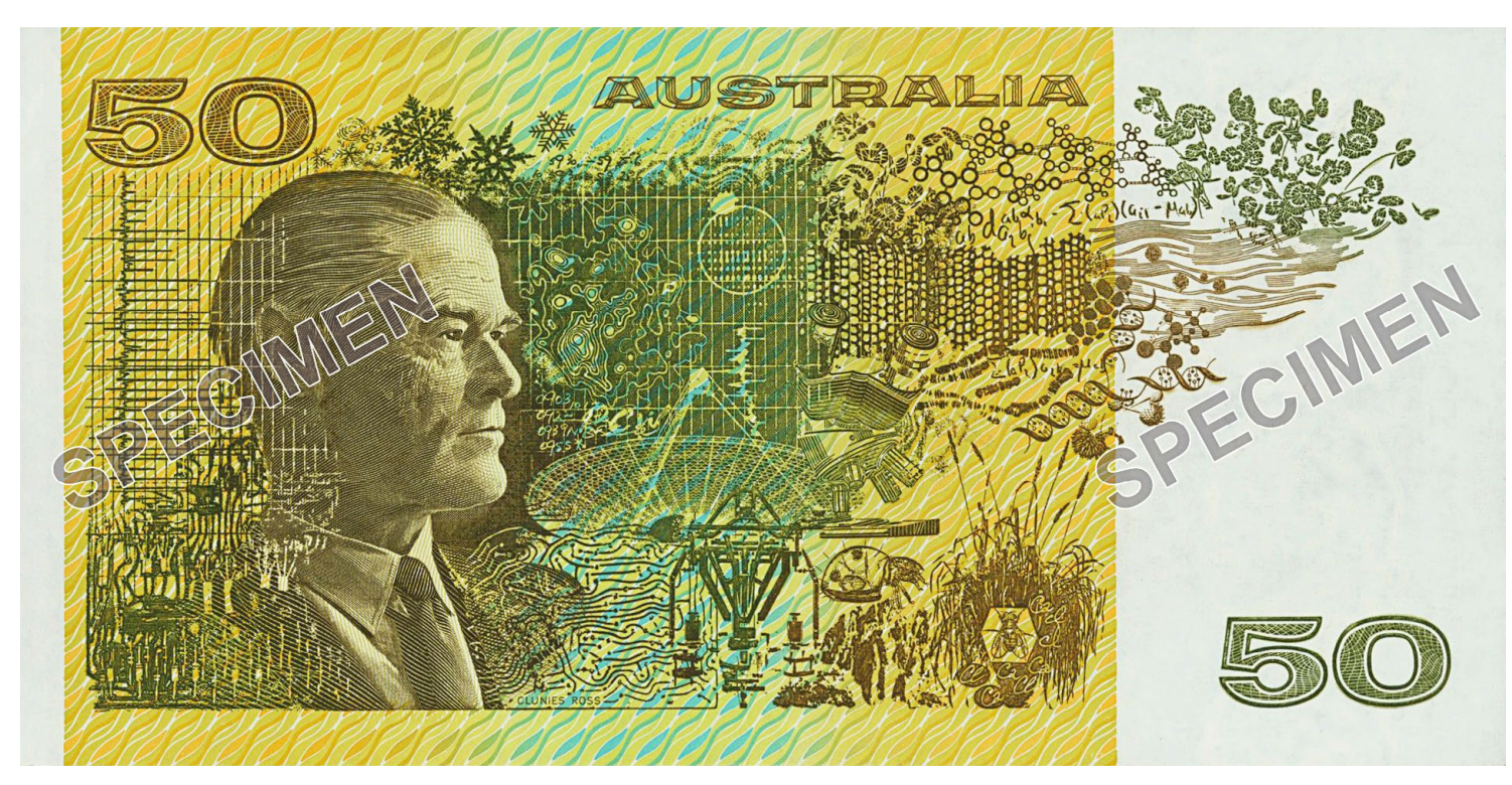
Reverse side of the 1973 $50 banknote